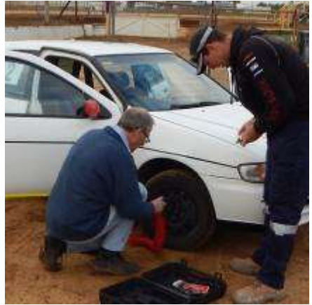
You got it wrong Dad!